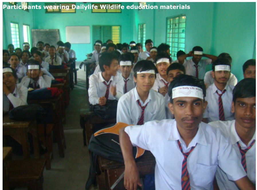
Participants wearing Dailylife Wildlife education materials