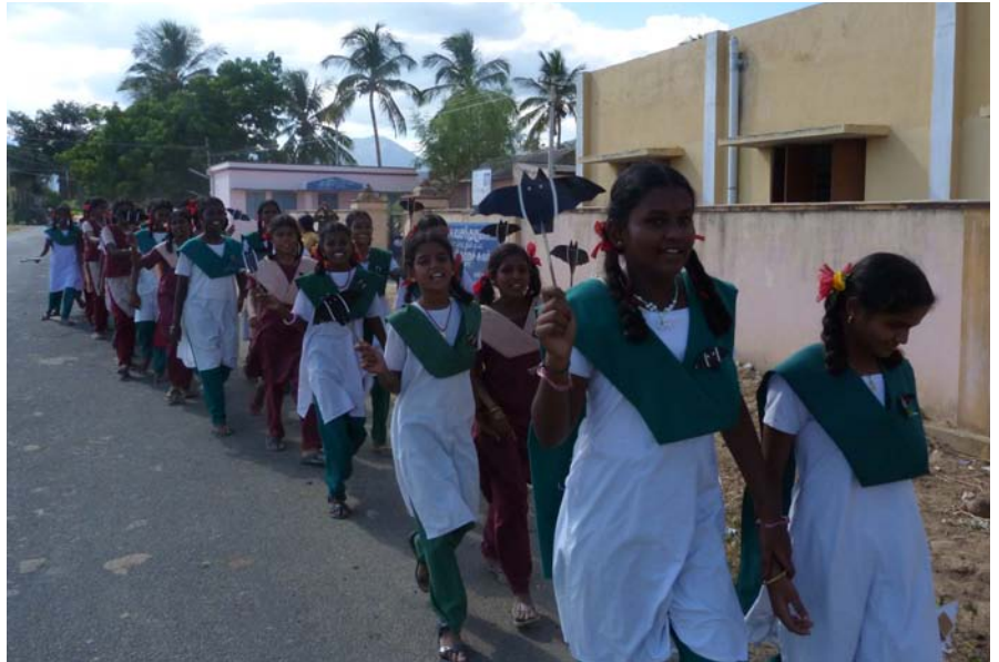
Students during bat conservation education procession