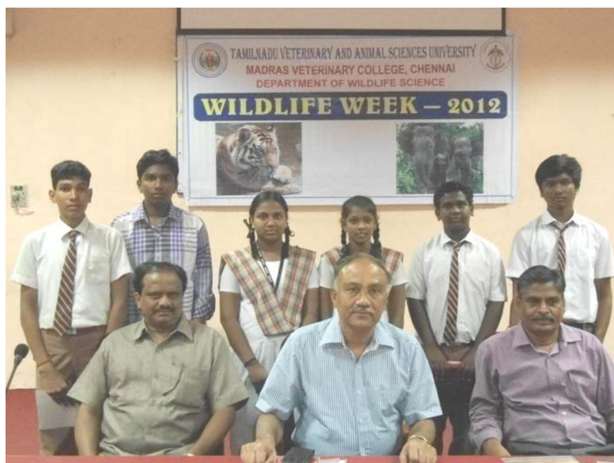
Chief guest with prize winners at Madras Veterinary College during wildlife week celebration