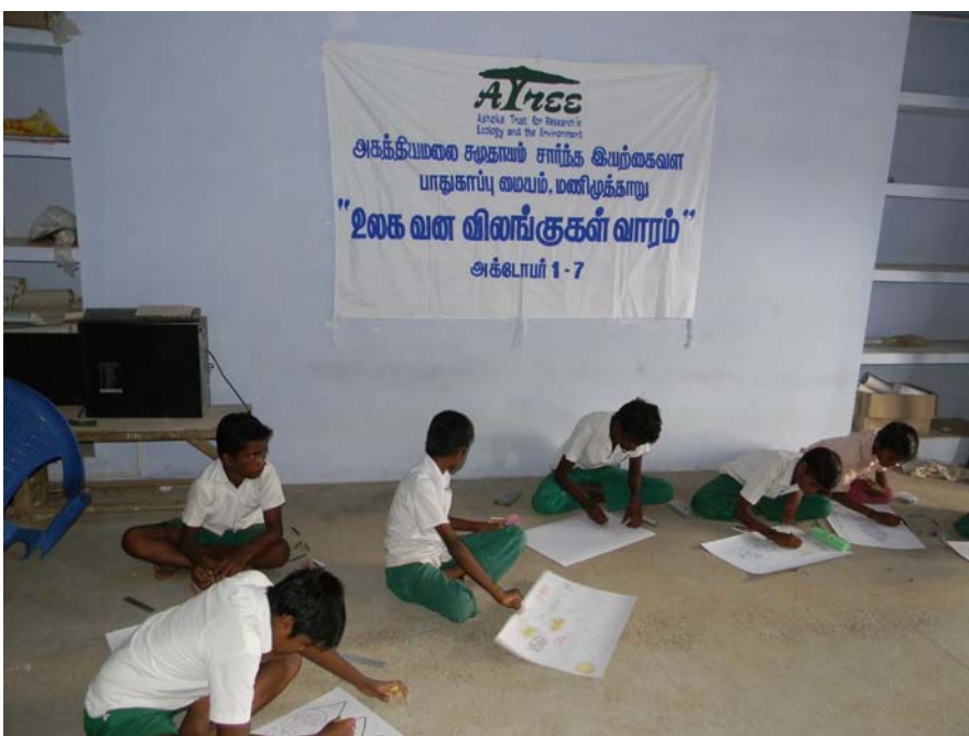
Drawing competition on bats at ATREE programme