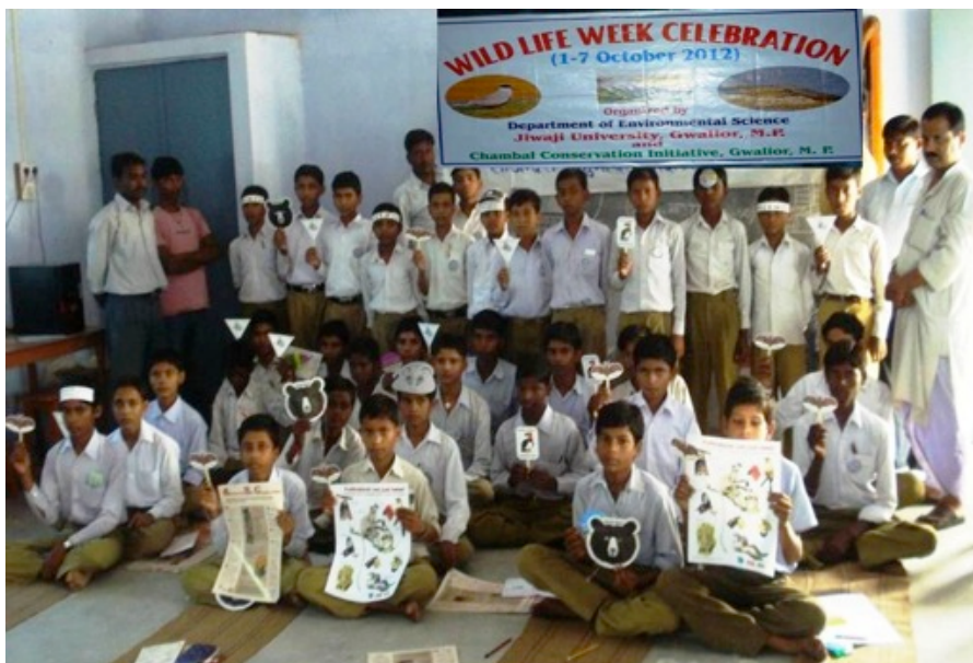
Gurukul Vidyadham students with Zoo's education kits