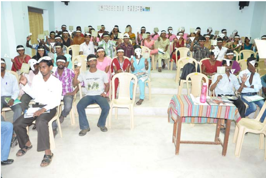
College students participated in the wildlife week symposium