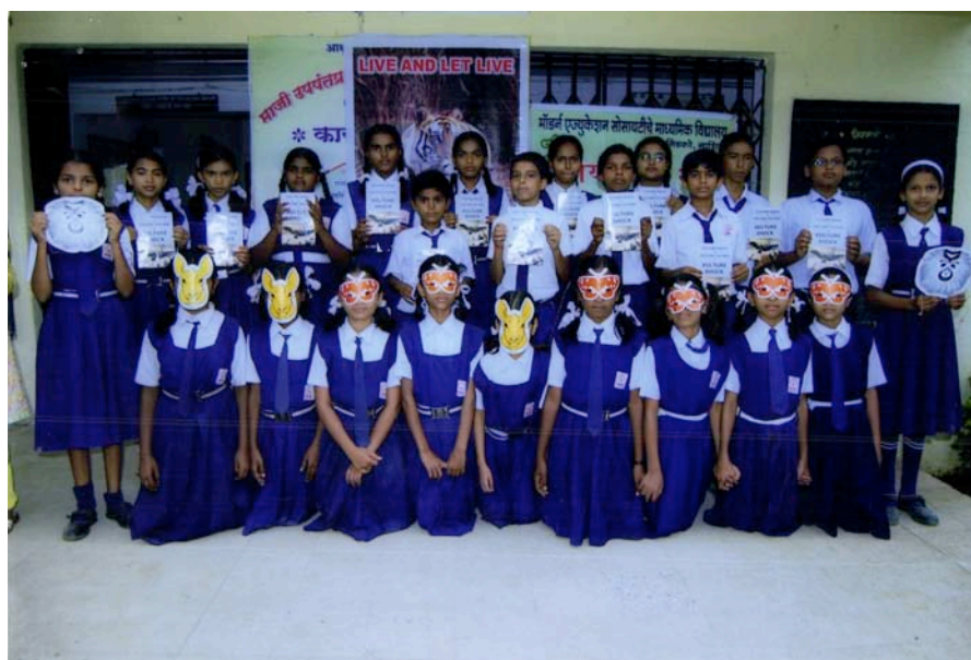
The importance of Vultures, Pollinators and other wildlife were told to the Nisarghala students