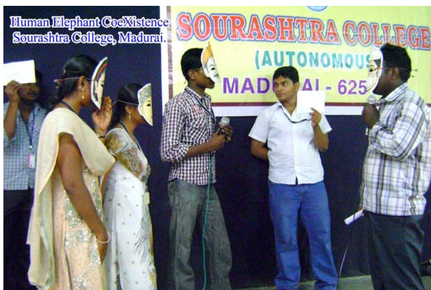
Mini drama on Human Elephant Coexistence conducted by Madurai College students