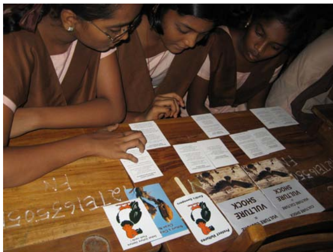
Students going through the information in vulture flash cards