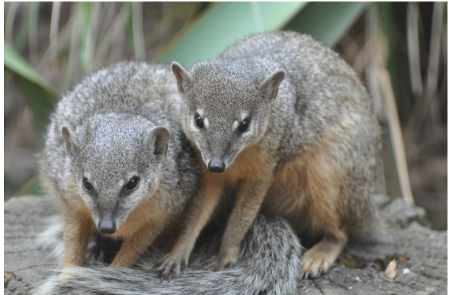
Narrow Striped Mongooses

Visitors enter the exhibit into an enclosed "corridor" with viewing windows into both the mammal and bird aviaries. There is also a window into the lemurs' indoor housing, allowing the visitors to view them when they are not in the aviary. The visitor can then enter a shelter through a set of doors that is attached to the bird aviary. Visitors are kept on their shelter by a wall at waist height. This allows free viewing and the birds to interact with the visitors,