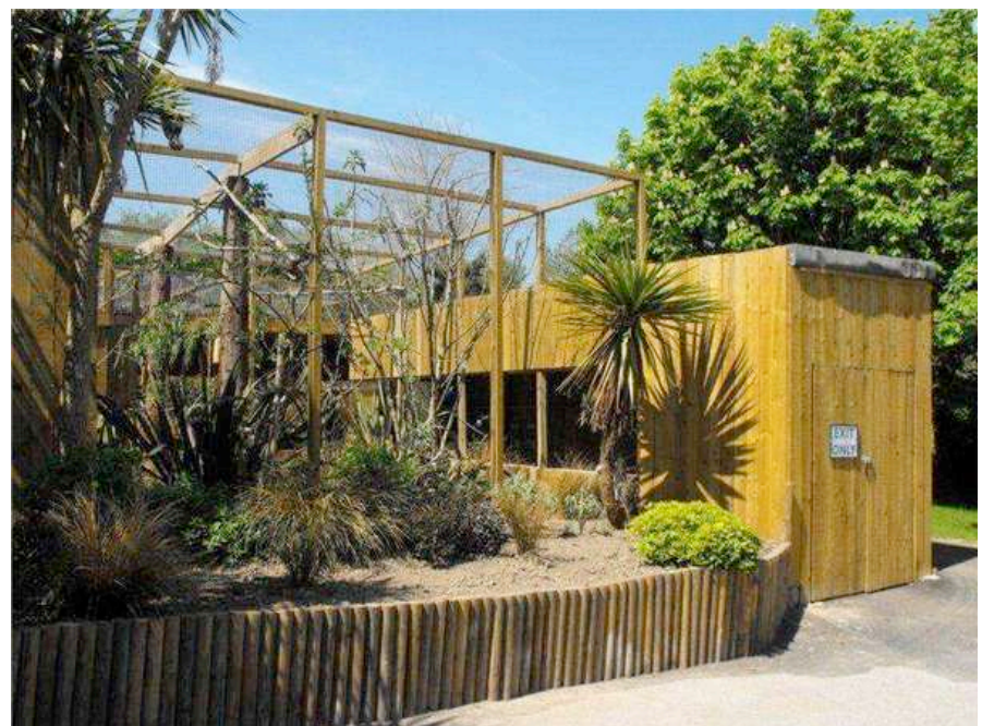
External view of aviary and the public exit from the shelter

FEATURES DEDICATED TO VISITORS: The exhibit was designed with a covered viewing area for viewing the mammal aviary, and a shelter for viewing