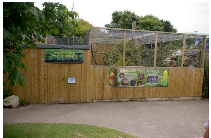
Signage and entrance into Madagascar Walkthrough © Scott Pooley, 2011