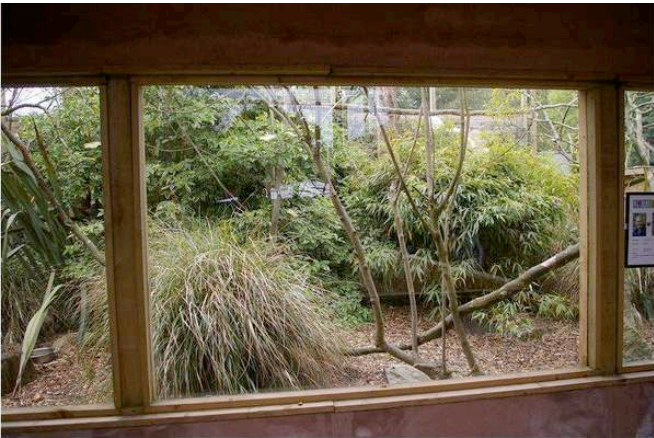
View into the mammal aviary, as seen from the visitor walkway