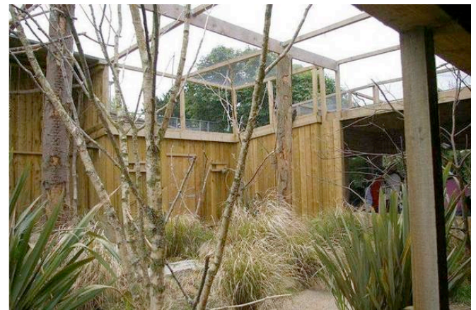
View into the bird aviary from the public gallery in the shelter