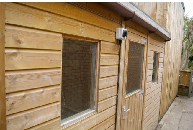
Keeper access to the off-show enclosures