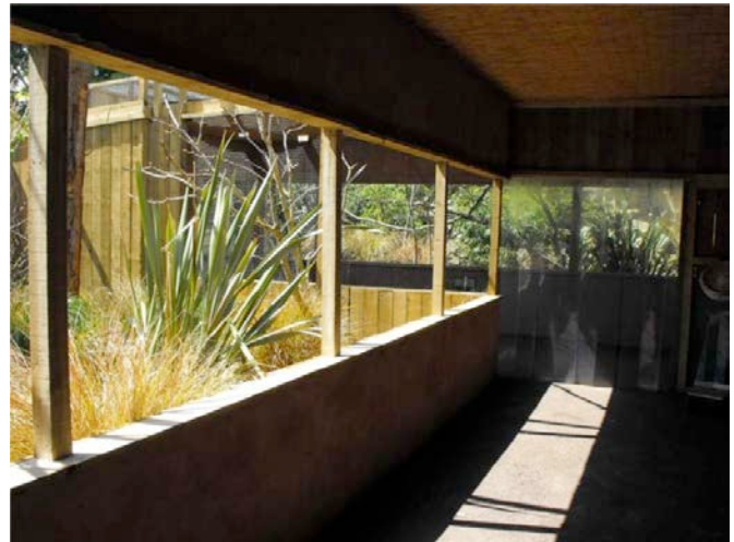
Public route through the bird aviary showing open viewing

The zoo participates in international breeding programs with the greater Vasa parrots and crowned lemurs. As of 2012, there was no international breeding program for narrow-striped mongooses, but the captive population is monitored and the zoo participates in this. Very few new materials were bought when constructing the exhibit. All features of the exhibit were recycled from the previous exhibits