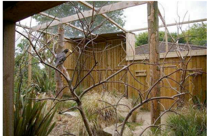
View into the bird aviary from the public gallery in the shelter

the bird aviary, as there are few viewing areas in the zoo that protect the visitor from the weather.