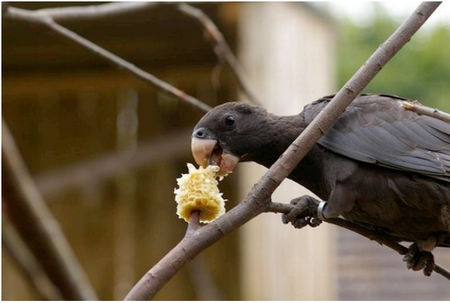
Vasa parrot eating skewered food