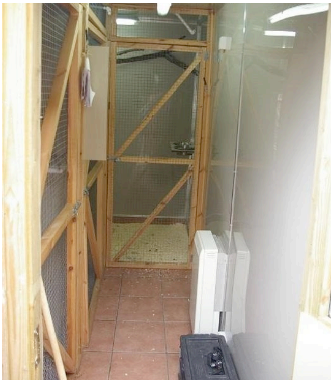
Entrance into the lemur and mongoose off-show enclosures