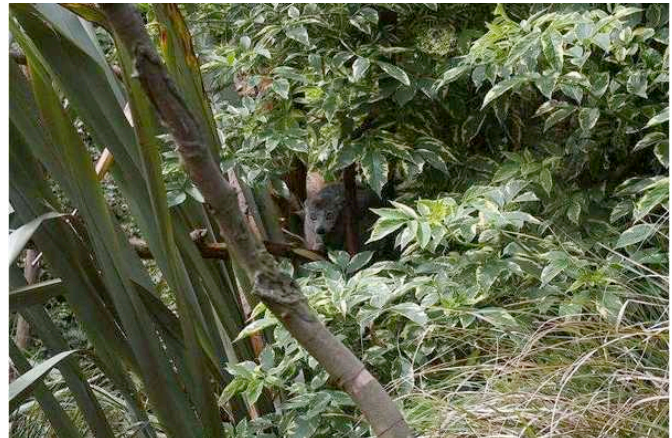
Environmental Enrichment - Female crowned lemur concealed in the shrubs