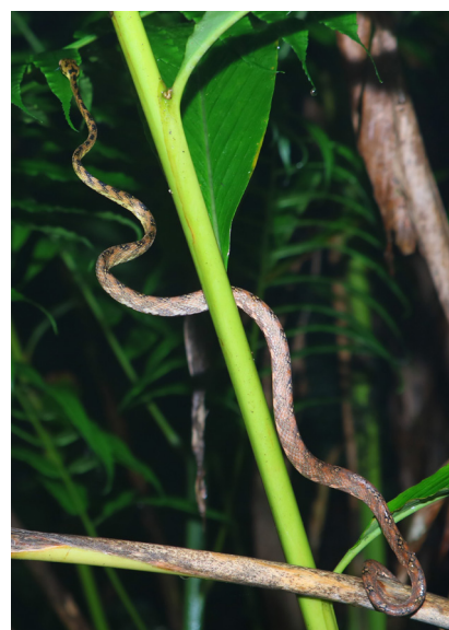
Dorsal body of Thackeray's Cat Snake Boiga thackerayi from Mojo plantation, Kodagu District, Karnataka, India.