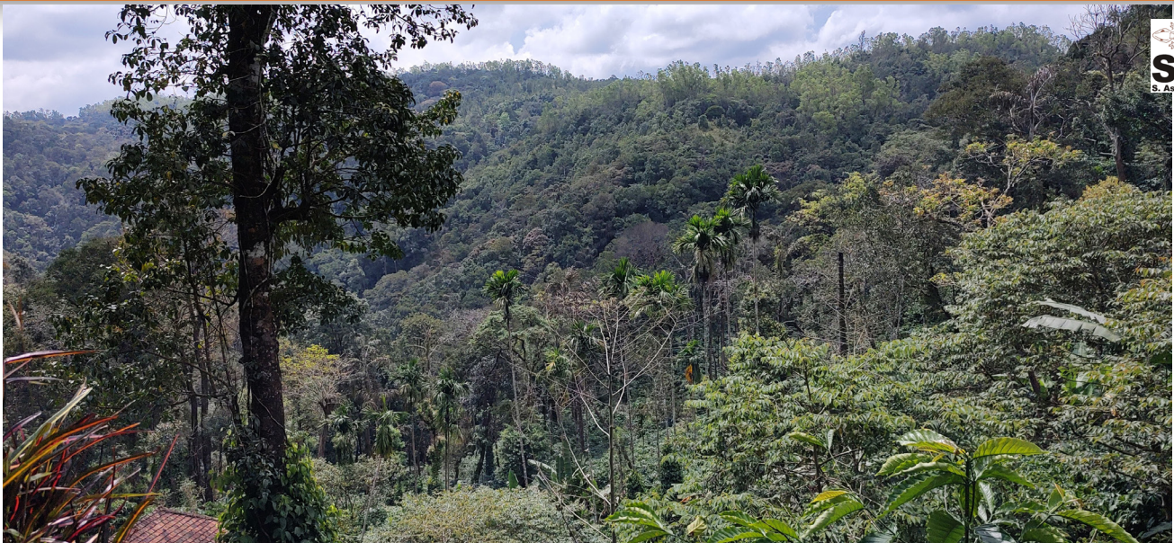
Habitat at the site where the Thackerayi's Cat Snake was spotted at Mojo Plantation.

The snake was found in a rain forest habitat with native trees which also had plantations of Black Pepper, Cardamom, Coffee, Vanilla, Cinnamon, Kokam, Ginger, Turmeric, Allspice, and other fruits and vegetables.