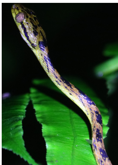
Side view of head of Thackeray's Cat Snake Boiga thackerayi from Mojo plantation, Kodagu District, Karnataka, India.