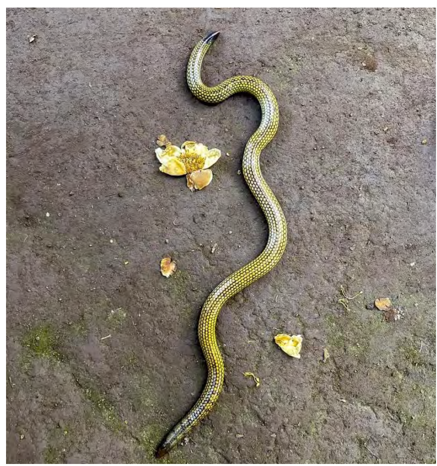
Woodmason’s Earth Snake Uropeltis woodmasoni in Nilgiris, Tamil Nadu, India.

On 24 May 2022 at 1030 h, we recorded the Woodmason’s