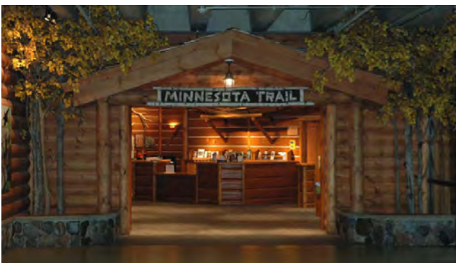
Minnesota Trail Entrance.

Our interpretive goals are: to excite visitors about Minnesota’s animals and their environment, to