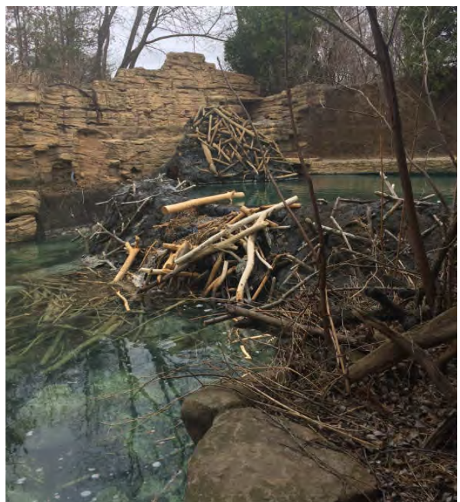
Beaver Exhibit.

The Minnesota Trail project was designed primarily "in-house" using the zoo's project management staff, exhibit design staff, carpenters, plumbers, electricians, horticulturists and interpretive staff. Building materials from Minnesota were used in construction.