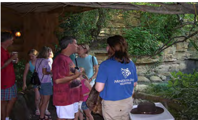
Volunteer Information Point at Exhibit.

A visitor study was carried out in 2007, which ranked the Minnesota Trail as the highest rated experience at the Zoo. It measured reactions to the new exhibit complex as well as the interpretive effectiveness of the Minnesota Trail.