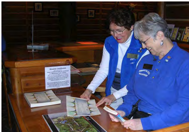
Information Volunteers.