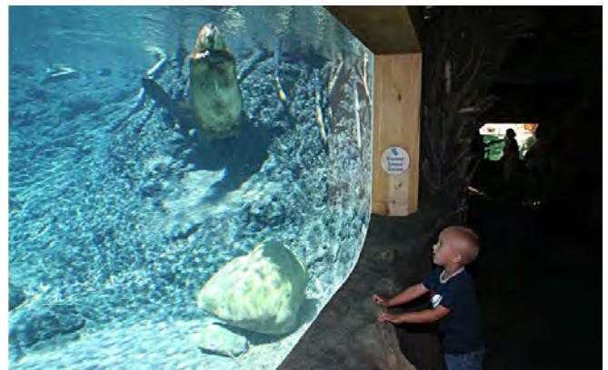
Underwater Beaver Viewing.

To connect with Minnesotan memories and traditions, the entrance of the new trail was designed to look like a North Woods lodge, complete with old photos, fishing gear, an authentic Ojibwe birch bark canoe and a massive stone fireplace. The trail itself was also designed to conjure memories of exploring the outdoors, with subtle artificial animal tracks and scat along the pathway that is designed to look and feel like a wood chip/leaf litter trail in the woods. Volunteer interpretation was built in as a critical interpretive component of the Minnesota Trail. The Trail was designed with several built-in benches for interpreters to sit, display artifacts and interact with guests. The entrance lodge includes an interpretive desk where volunteers are stationed every day to