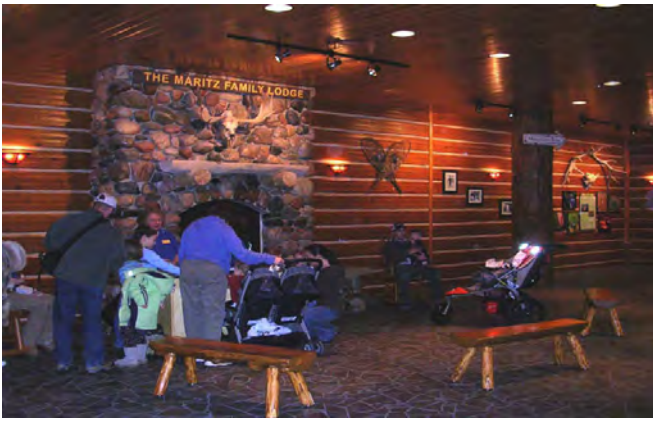
Minnesota Trail Main Lodge Fireplace.

greet guests, answer questions and hand out kid's activities. Live Minnesota animal demonstrations (porcupines, opossums, raptors, reptiles and amphibians) take place daily on an interpretive cart that is moved into the main lodge. Along with the entrance lodge, the Trail's other primary interpretive hub is the Wolf Cabin.