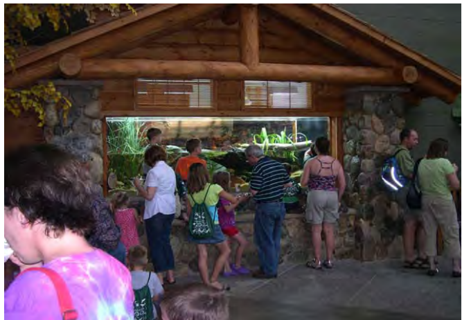
Minnesota Trail Main Lodge.