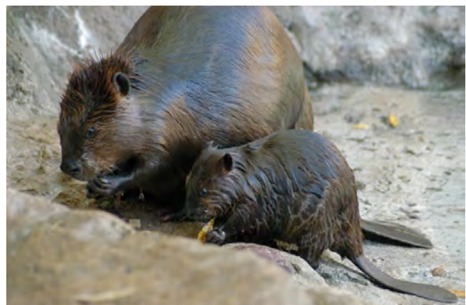
Beaver with Young.