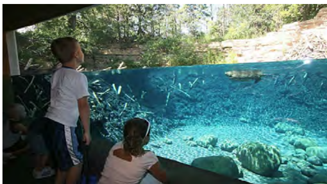
Split View.