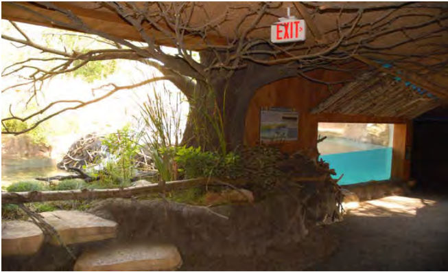
Beaver Exhibit.