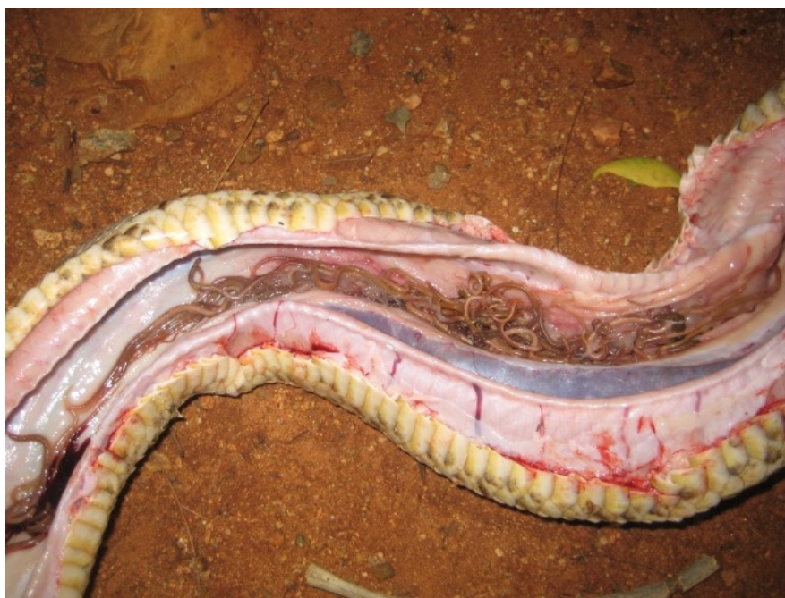
Fig.2. Image showing large number of entangled worms in the gut of python.