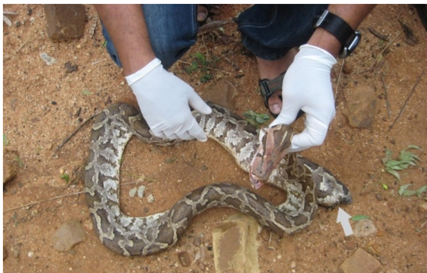
Fig.1. Arrow mark in the image indicates the injury at tail region of python

The recovered worms were fixed in 10% formalin. Few worms were subjected to dehydration using descending grades of ethanol (70-100%) and cleared with lacto-phenol (Meyer & Olsen 1975). Specimens were examined using compound microscopy for the morphological identification.