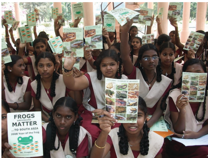
Renganathapuram Corporation Girls HS School students with amphibian kits