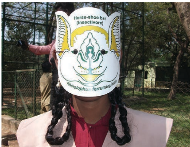
Bat Girl poses showing her mask at VOC Zoo