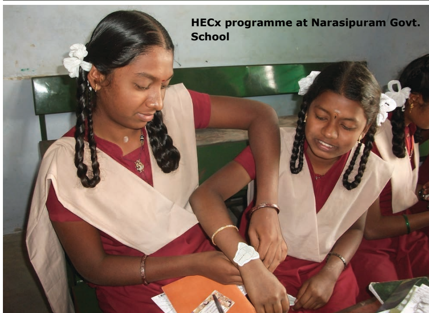
HECx programme at Narasipuram Govt. School