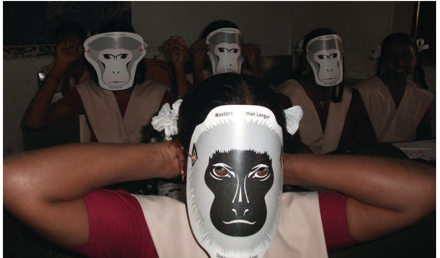
Monkey Manners programme at Peelamedu CHSS

On 24 January we arranged another programme at Narasipuram Government High School. Fifty students of class VI-IX participated in the programme. They were also taught about animal welfare and laws pertaining to it. ZOO's Human Elephant