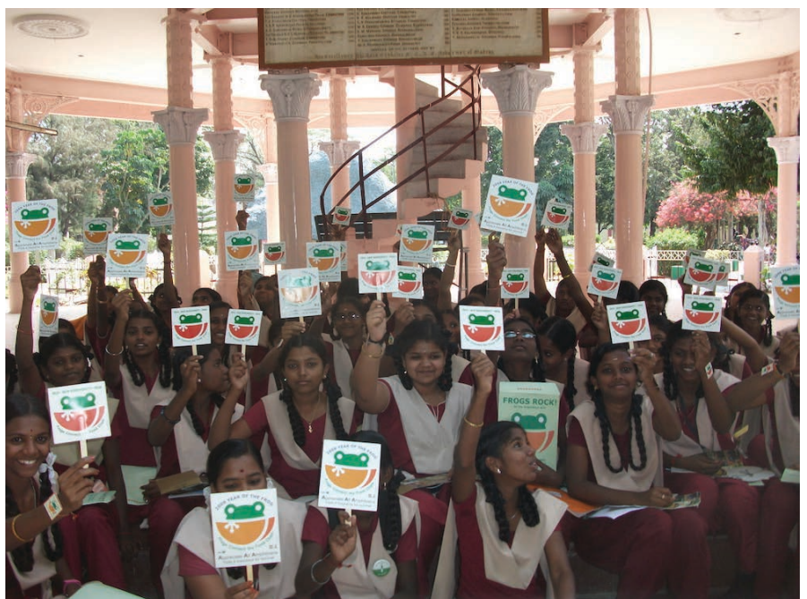
Amphibian programme at VOC Park Zoo, Coimbatore