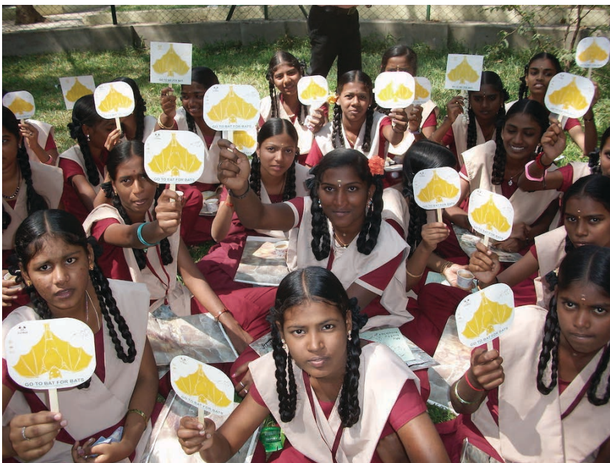
Bat awareness programme at VOC Park Mini zoo with Siddapudur School students