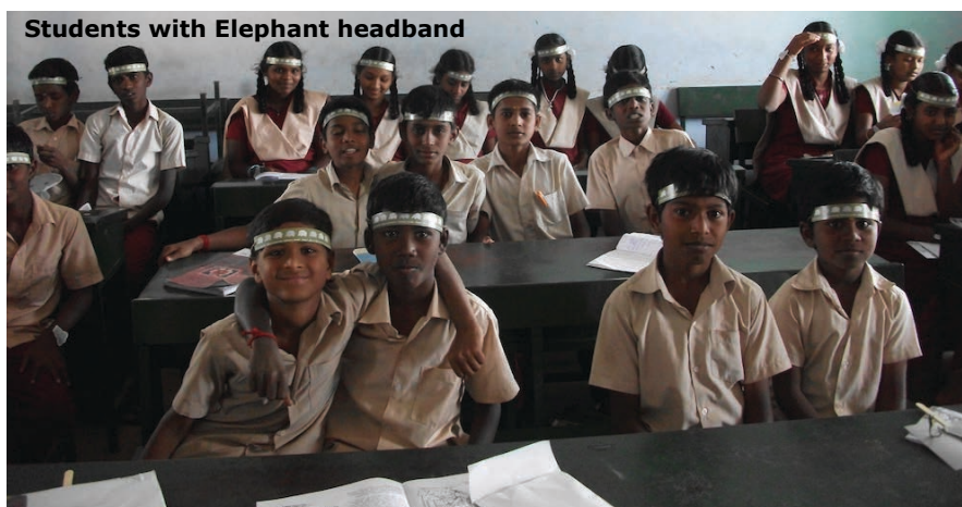
Students with Elephant headband